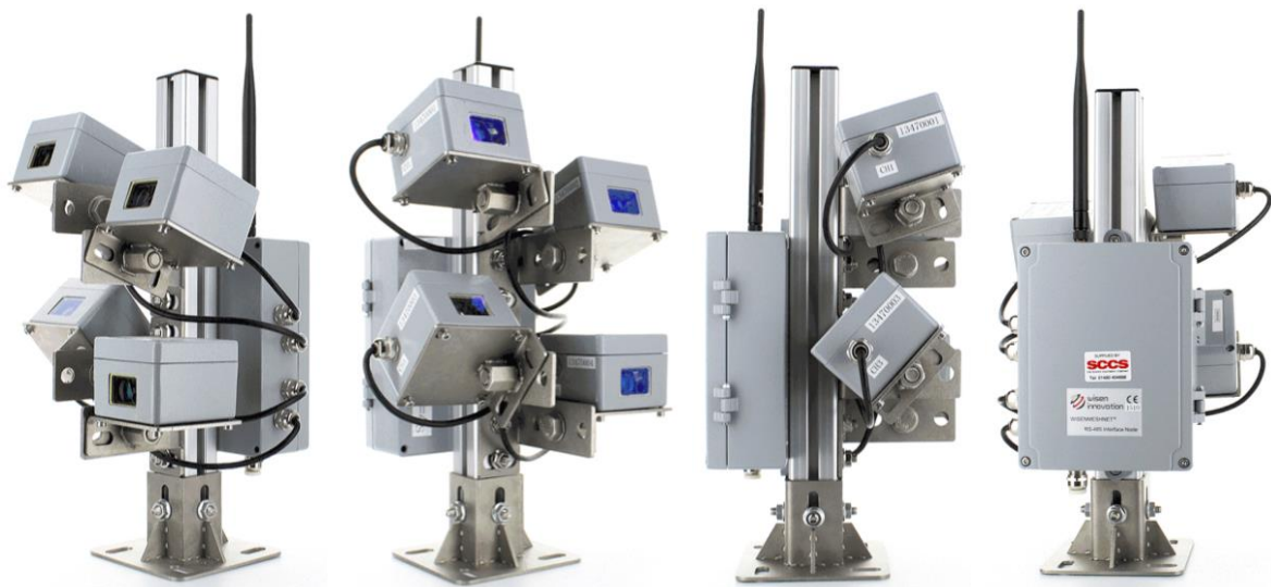
Figure 1. 4-Channel RS485 Interface Node Overview (with external Laser Distance Sensor, as example).

Our product has IP66 and is designed to work in a tough environment. It is small in size, reliable in performance, easy for maintenance, has high precision during sampling, and has strong immunity to radio-interference.